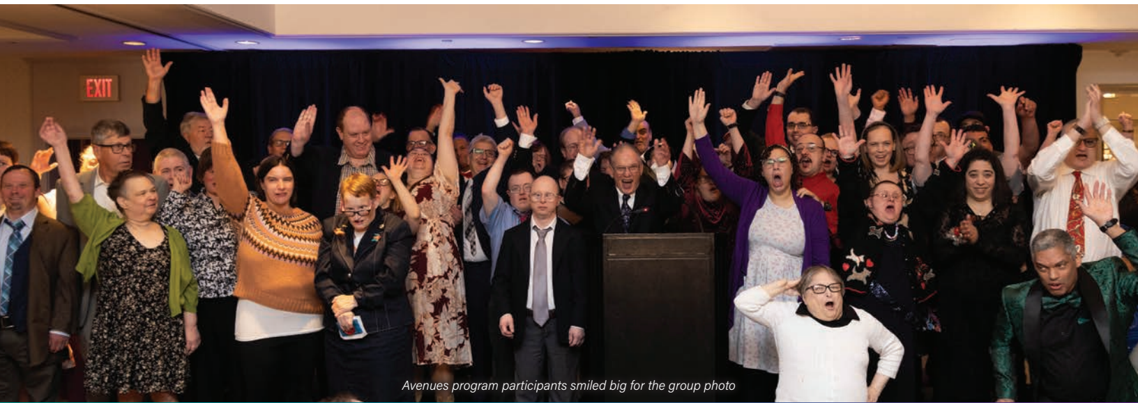
Avenues program participants smiled big for the group photo