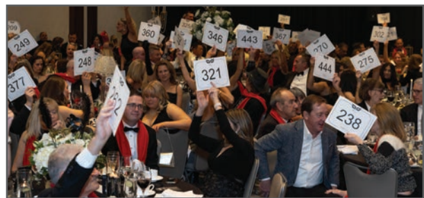
An exciting paddle raise in support of the Hornbrook Adventure Program.

The evening culminated in an exciting paddle raise, ensuring that any Avenues client who wants to travel will have the opportunity to attend a HAP trip within the next three years. Overall, Masquerade Noir was an outstanding success, raising more than $620,000 to support the people of Avenues.