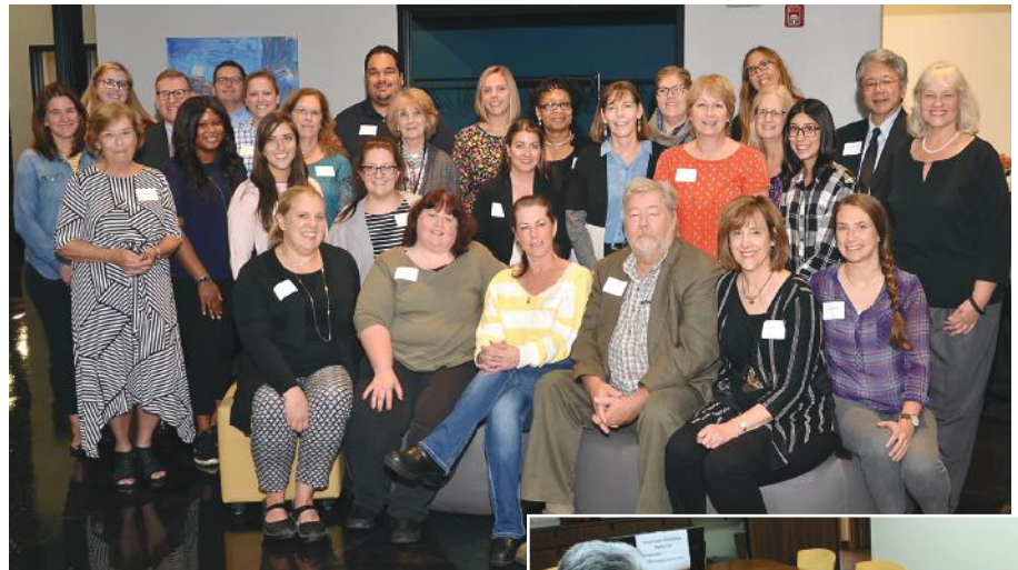
Staff gathers to celebrate the opening of the Center for Independence. More than 40 percent of the 100 staff members have been at Avenues for more than 10 years; the leadership team averages more than 30 years..

Now, much more help would be needed during the day in the homes. So staff members stepped up to help.