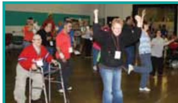
Professional Zumba exercise classes were introduced at the party, thanks to the efforts of the Suburban Partnership Board. The classes were so popular that the Work Center continues to sponsor them twice a week.