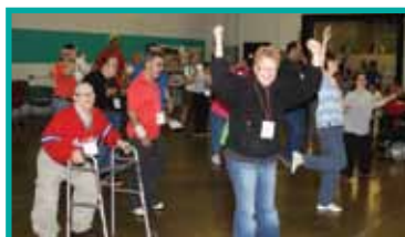
Professional Zumba exercise classes were introduced at the party, thanks to the efforts of the Suburban Partnership Board. The classes were so popular that the Work Center continues to sponsor them twice a week.